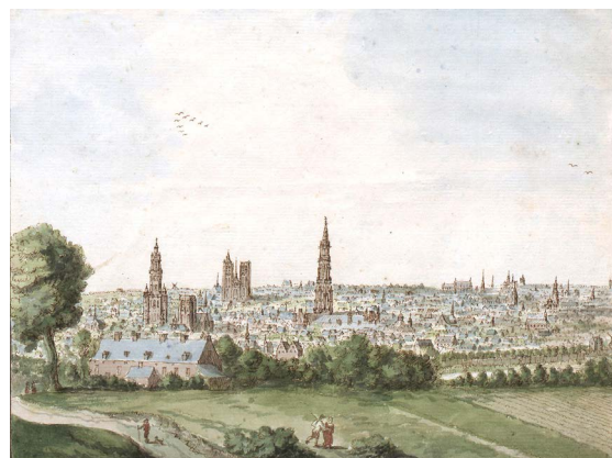
View of Brussels from Scheut and Lazaretto by Hendrik van Wel, c. 1695, 20,1 x 26 cm, album. ©KBR, CdE, F 12568.