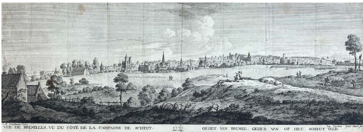
View of Brussels from the Countryside of Scheut by Antoine Alexandre Joseph Cardon, 1777, 23 x 58 cm.